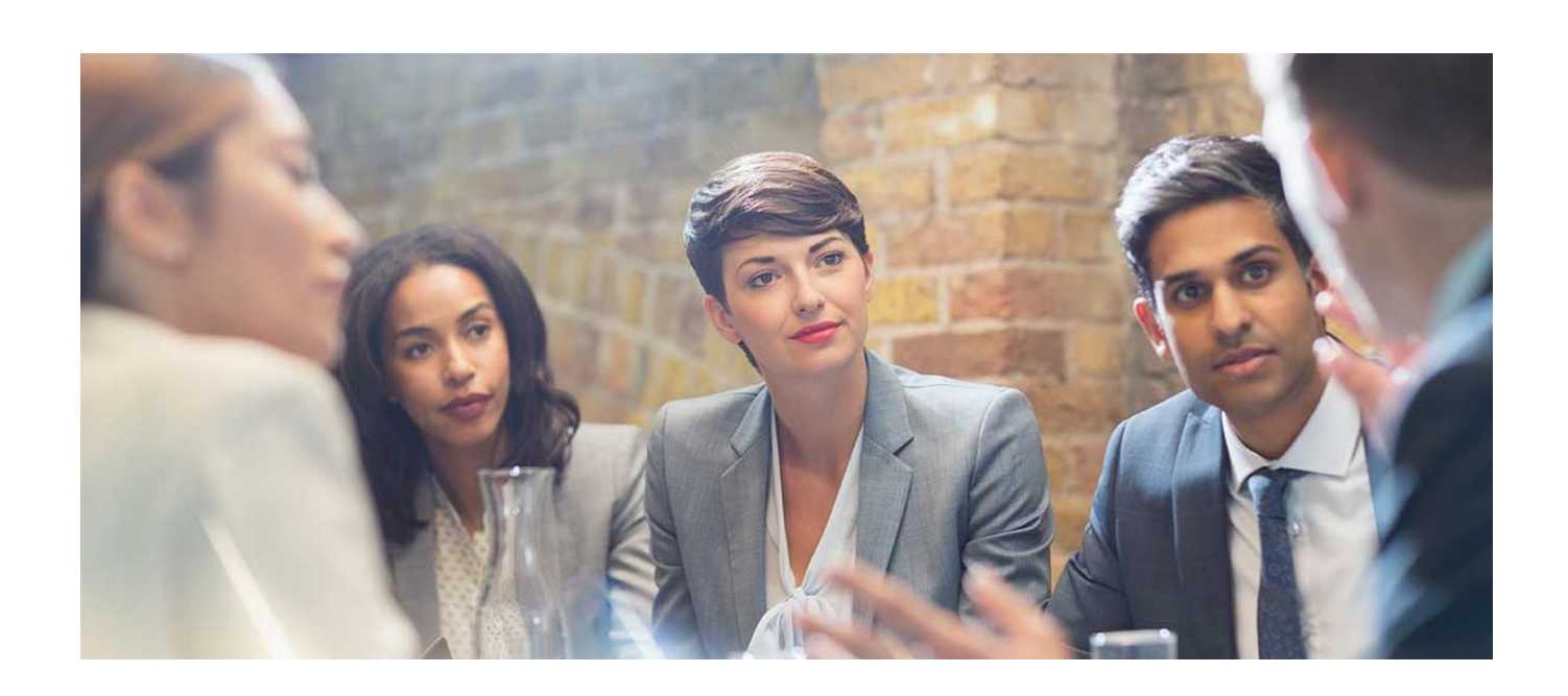
Solvency and Financial Condition Report "SFCR"